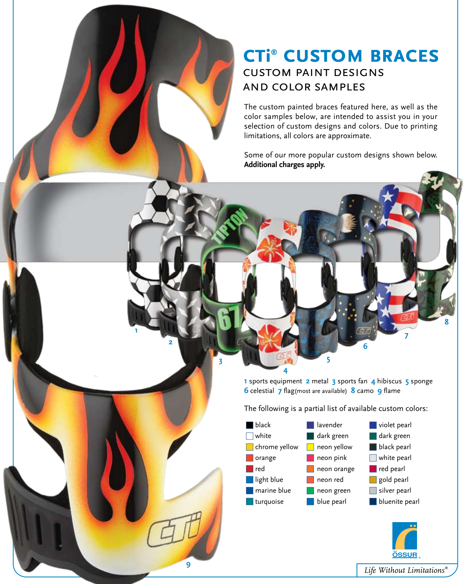
1 sports equipment 2 metal 3 sports fan 4 hibiscus 5 sponge 6 celestial 7 flag(most are available) 8 camo 9 flame

Some of our more popular custom designs shown below. Additional charges apply.